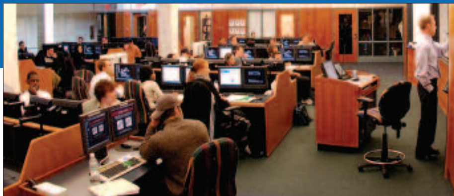
Bentley students use real-time data and analytical tools in the Trading Room.